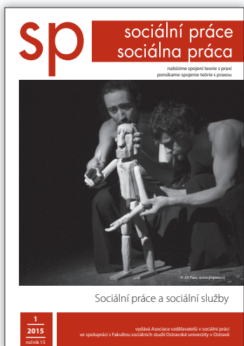
Social Work and Social Services