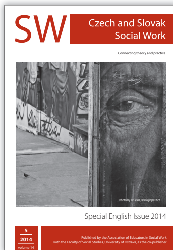
Special English Issue 2014