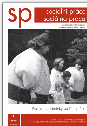
Working Conditions of Social Work

ISSN 1213-6204 (Print) ISSN 1805-885X (Online)